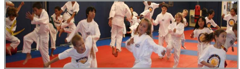
Flying Side Kick Practice at Taekwondo Camp