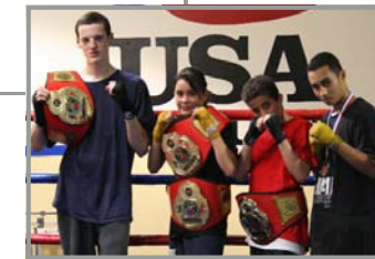
Desert Spring Showcase Champions